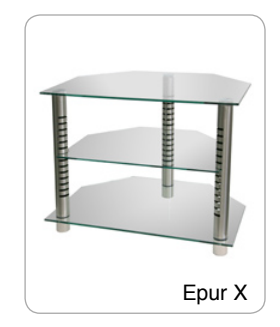
Mise à jour: 09/08/2006